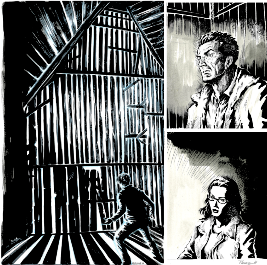
In the Barn