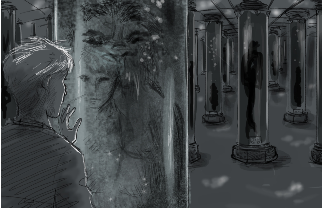
Practice sketch - Dark