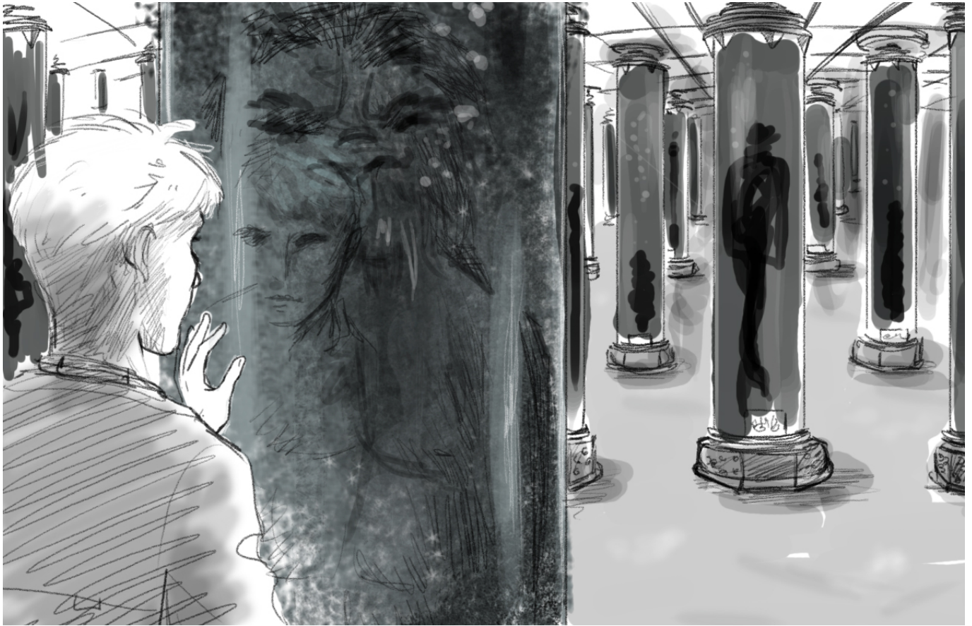
Practice sketch - Light